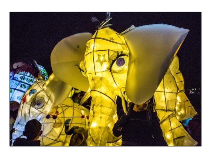
Photos in this report are from the 2020 workshops and previous Church Road Lantern Parades.